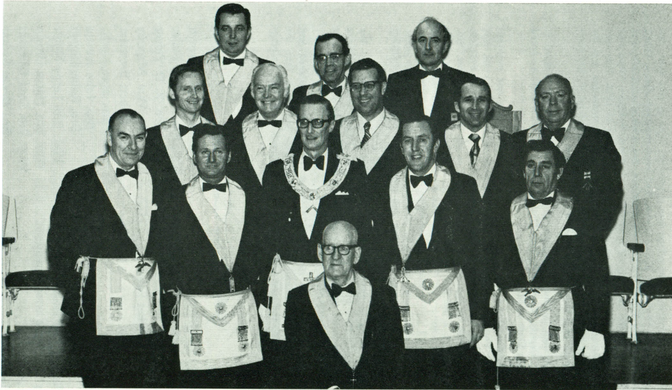
1972 Officers of Ashlar Lodge